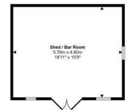
Shed / Bar Room Approx 28 sq m / 298 sq ft

This floorplan is only for illustrative purposes and is not to scale. Measurements of rooms, doors, windows, and any items are approximate and no responsibility is taken for any error, omission or mis-statement. Icons of items such as bathroom suites are representations only and may not look like the real items. Made with Made Snappy 200.